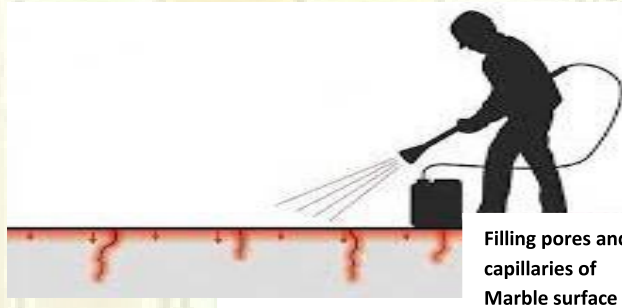
Marble surface treated with HP Marble Denso 85