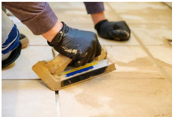
Application of Grout Admixture with H.P Grout in Grout Joints